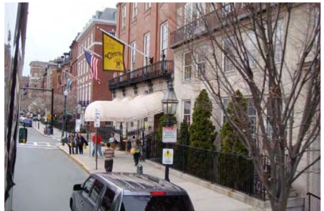
Cheers! Where everybody knows your name - oops!