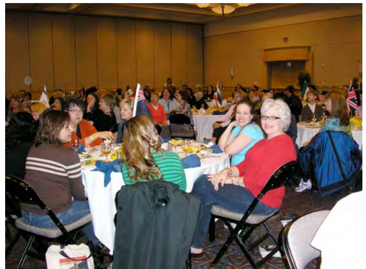
TNTESOL Convention attendees, Chattanooga, March 4-6, 2010