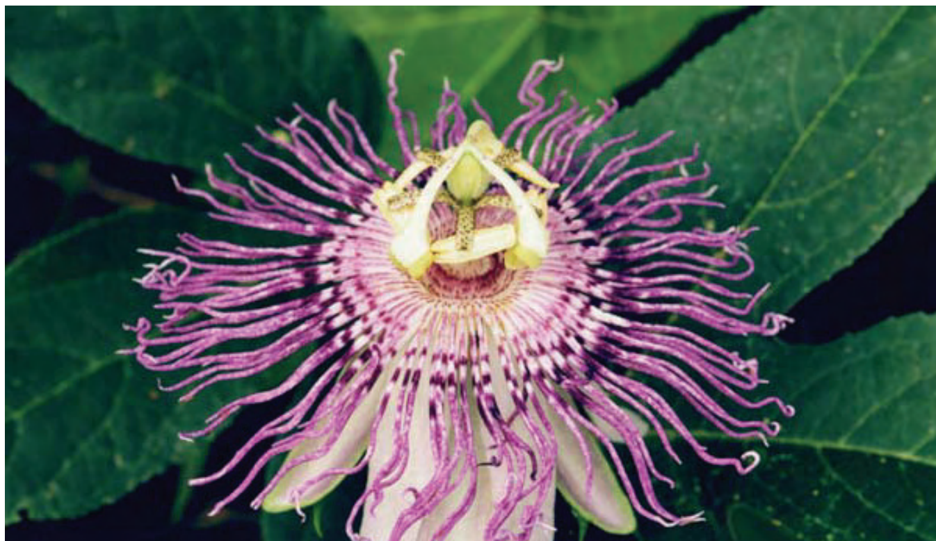
The Passion Flower Passiflora incarnata Tennessee state wildflower